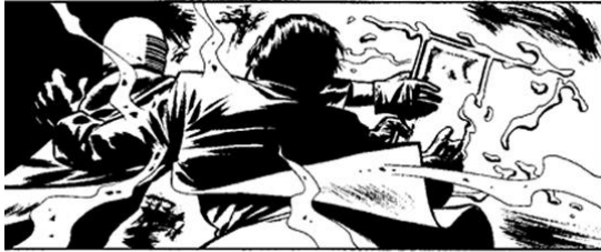
Joe Casey's Codeflesh